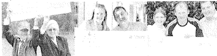
Goodluck from me and the entire staff of the UK LOTTERY.