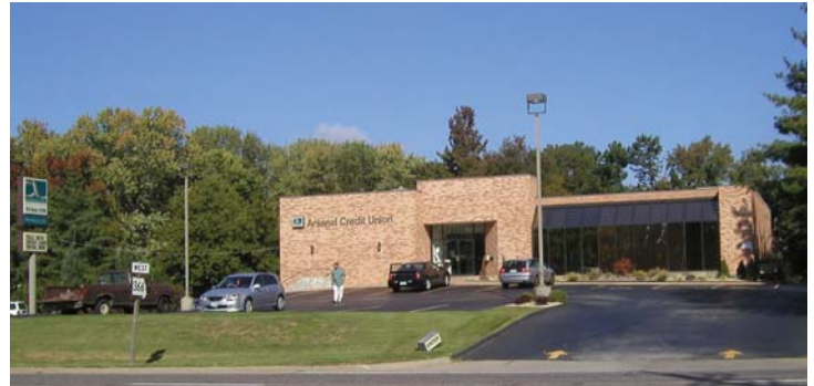
Mid County location as it currently looks

We will follow construction progress in future issues of Member's Edge and on the "What's New" section of our Web site ( www.arsenalcu.org ). Be sure to check out new details and photos as they become available.