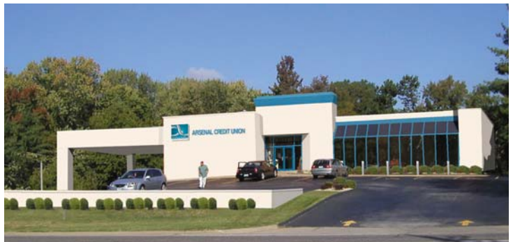
Mid County location after construction is completed in 2007